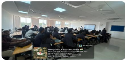
Meta for Digital Marketing